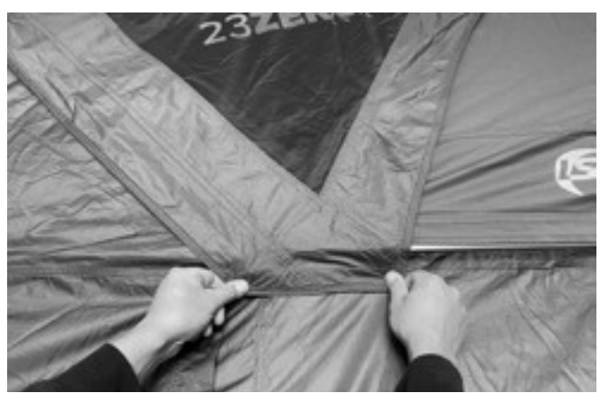
Set up Complete