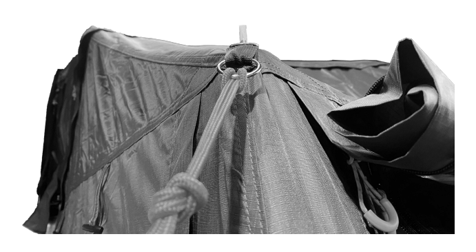
Set up Complete